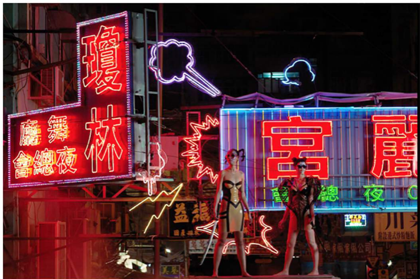
Wing Shya, Sweet Sorrow series, courtesy of Blue Lotus Gallery